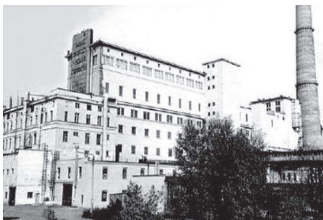
Figure 8. Plant B in Chelyabinsk-40, based on acetate-fluoride technology, operated 1948-1960.

products) were rejected with the plutonium-denuded solution. An oxidation-reduction cycle of purification ensued—the \text{NaUO}_2(\text{CH}_3\text{CO}_2)_3 solids with the coprecipitated Pu(VI) were dissolved, the Pu(VI) reduced to Pu(IV), and \text{NaUO}_2(\text{CH}_3\text{CO}_2)_3 again precipitated, leaving the Pu(IV) in solution but \text{NaUO}_2(\text{CH}_3\text{CO}_2)_3 solids, destined for separate uranium recovery, carrying much of the remaining fission products. After this cycle, Pu(IV) was coprecipitated with \text{LaF}_3 . The B Plant at Mayak (Figure 8) began operations on December 1948, exactly four years after start-up of Hanford's T Plant, by the successful dissolution of irradiated uranium fuel. However, initial plutonium recoveries within the analyzed solids and solutions were low.