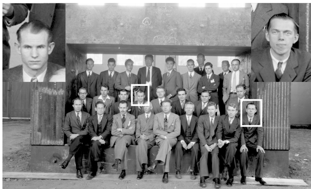
Figure 1. Edwin McMillan (left) and Philip Abelson (right), co-discoverers of neptunium. Photo taken in the Berkeley 60-inch cyclotron magnet, September 1938. E. O. Lawrence is seated in the front row, middle, and Robert Oppenheimer is standing in the top row, middle, above Lawrence.

was fortuitous and unexpected even for its inventors (9). The Seaborg research group, located at the Metallurgical Laboratory at the University of Chicago, investigated many candidate carriers for plutonium including the nearly insoluble phosphates of zirconium, niobium and thorium, as well as sodium uranyl triacetate as used by McMillan and Abelson for neptunium isolation and identification. Various advantages and disadvantages were found in these investigated carriers. For example, sodium uranyl triacetate carried plutonium but formed small crystals that filtered slowly.