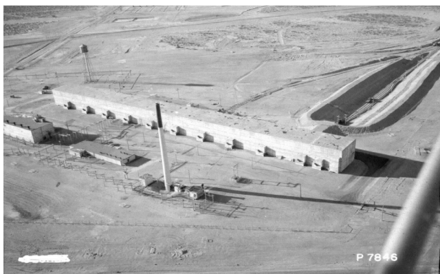
Figure 6. T Plant, Hanford, based on bismuth phosphate coprecipitation (long building at center) and lanthanum fluoride (building at the left), operated 1944-1956. Photo taken 22 December 1944, during initial start-up operations. Taken from archival original of Ref. 15.

key areas by European refugees (e.g., Enrico Fermi, Leo Szilard, Hans Bethe, John von Neumann, James Franck, Edward Teller, Rudolf Peierls, George Kistiakowsky), the key radiochemical separation innovations were solely products of US-born contributors.